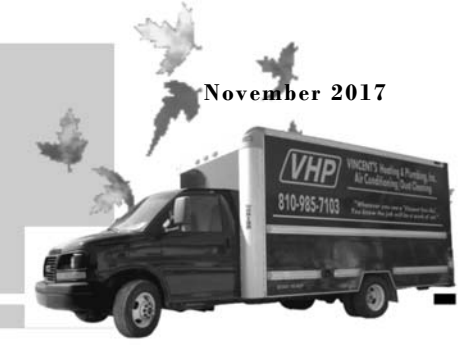
"Wherever you see a Vincent's Van Go' you know the job will be a work of art."