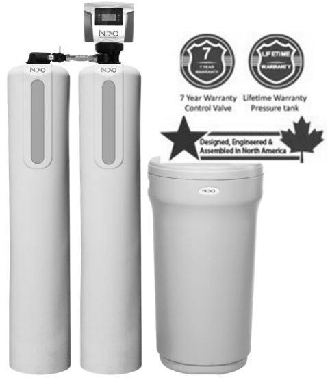
Hardness, Taste & Odor - softener eliminates hardness and carbon filter eliminate chlorine to give you healthy 'working water'.