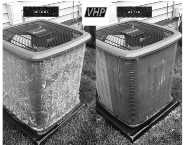
Before this AC condenser was serviced it was putting stress on the system and had decreased performance. The difference system maintenance makes is amazing!

How Do You End Heating & Cooling System Neglect? Turn Over for the Easy Solution